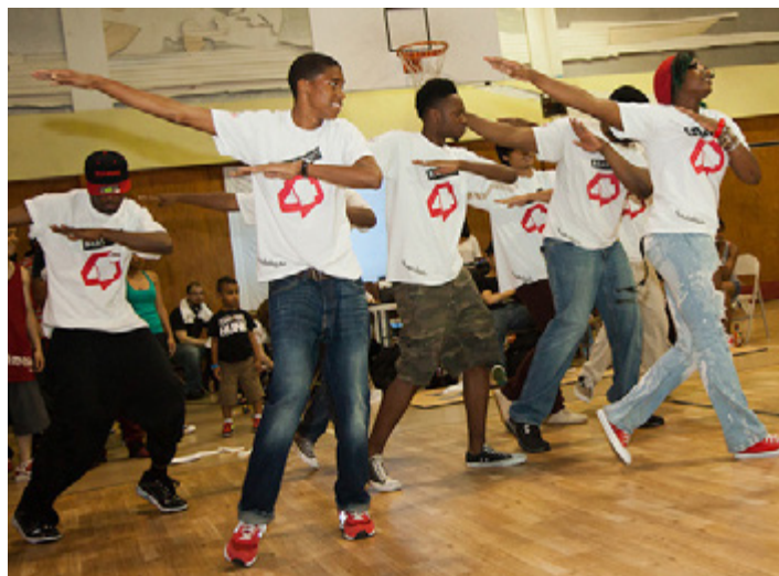
dance4life program dancers educate the crowd during Antidote!, a breakdancing competition for young men and women during AIDS Education Month.

Critical Path hosted over 60,000 visits at its 27 public computer centers across the City, including more than 16,000 at the Critical Path, AIDS Library, ICJ, and YHEP centers and provided over 7,600 hours of free digital literacy training .