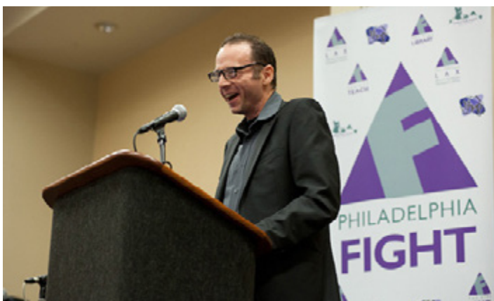
Timothy Brown, also known as the "Berlin Patient," discussed his journey as the only person cured of HIV during last June's Prevention and Outreach Summit.