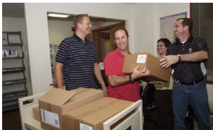
Volunteers from Janssen Therapeutics help unload boxes of the Greater Philadelphia AIDS Resource Guide during a volunteer day last Spring.