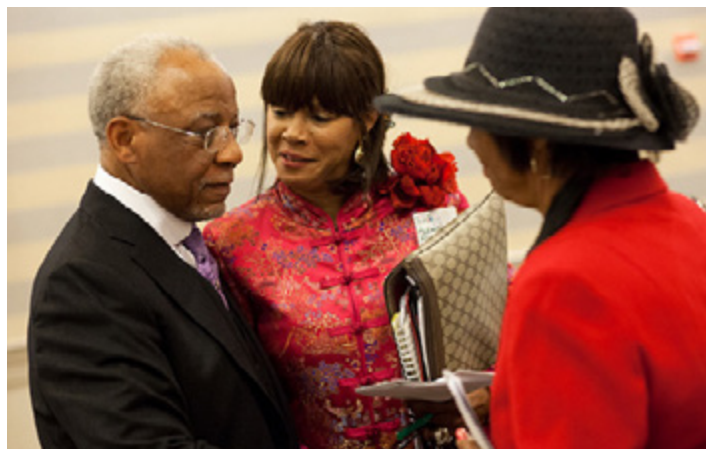
Keynote speaker and former Mayor W. Wilson Goode, Sr. greets those in attendance at FIGHT's Faith Leaders and Community Summit.

2012 saw the conclusion of a six year SPNS grant which has added valuable data to what we know about the transition from jail to care nationally and in Philadelphia. This data will be used in scientific publications and in the enhanced understanding of how to better serve the ex-offender community.